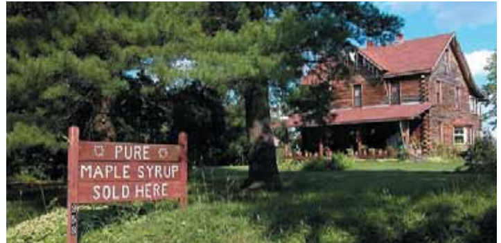
Kinzua Bridge Scenic Byway, State Route 3011, Pennsylvania's FIRST Scenic Byway

In the Allegheny National Forest region, everything is bigger. The sky is more vast, the mountains higher, the trees a bit taller. Travel into this area provides an opportunity to relax, slow down and unwind. You will discover “Authentic America” along the two-lane meandering roadway of Route 6, named by National Geographic Traveler as “One of America’s Most Scenic Drives.”